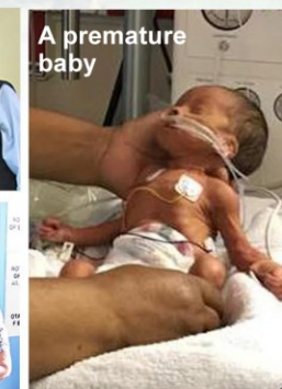
A premature baby