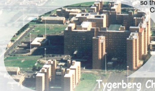
Tygerberg Children's Hospital

CONTACT Helène Visser helene@erasteer.co.za +27 82 574 9257